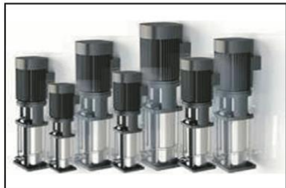
Industrial & Commercial Water Pumps