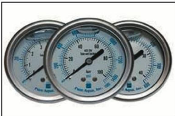
Water Monitoring & Testing Instruments