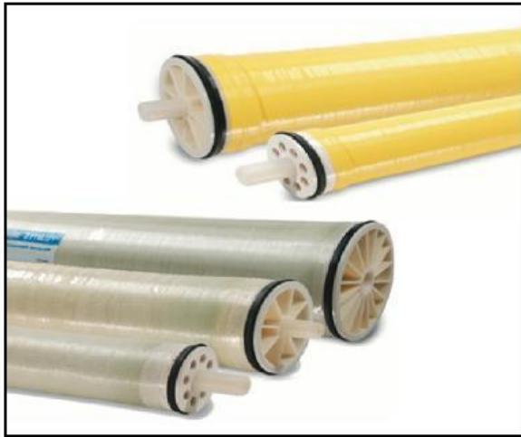
Membrane Element (RO, NF, UF)