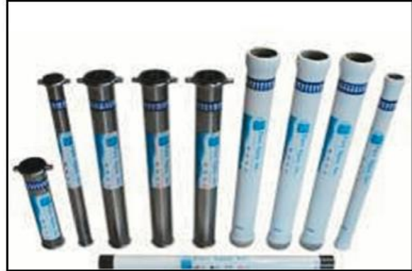
Membrane Pressure Vessels