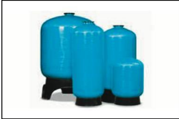
FRP Filter Tanks